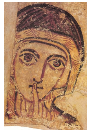
St. Anne fresco, National Museum, Warsaw. Coptic, 8th Century